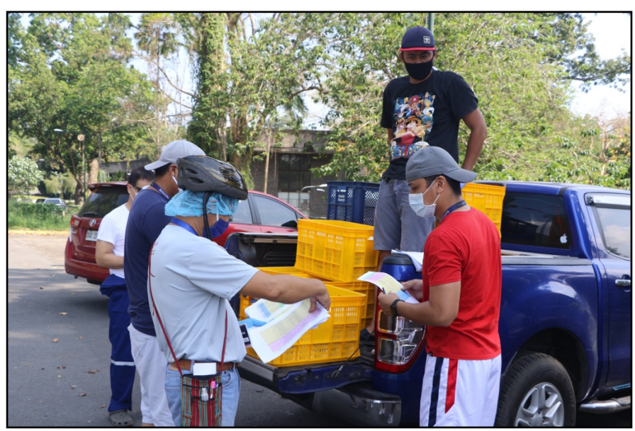
Photo 2: DTRI distributes fresh milk to stranded dormers on campus

Owing to its vast research on agriculture, food science and technology, UP Los Baños led various initiatives that helped provide food, drinks and food sources to stranded dormers in campus. Various units such as the Institute of Food Science and Technology (IFST) and Dairy Training and Research Institute (DTRI) have distributed bottled calamansi juice and fresh milk, respectively, to students. The Institute of Plant Breeding-National Seed Foundation, on the other hand, distributed seeds and seedlings for pakbet mix vegetables, pechay, lettuce, and upland