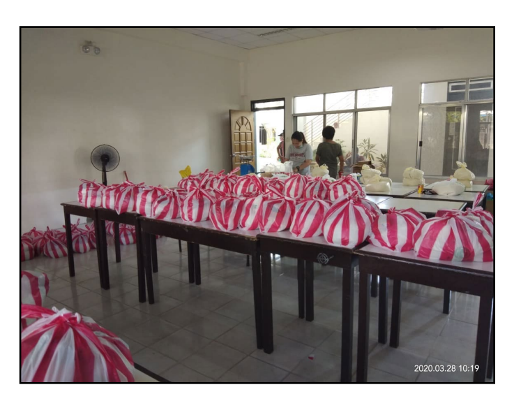
Photo 1: UP, Magbubunga Tayo and UP Danay prioritizes relief operations for students and communities

UP Manila led a blood drive appealing to COVID-19 survivors, coupled with a comprehensive set of infographics that share important information about convalescent plasma, the blood component extracted from the blood of the survivors. The infographic has tackled the potential use of the convalescent plasma in the treatment of COVID-19 patients.