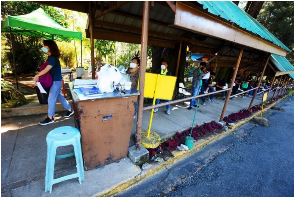
(UP Baguio employees as they enter the campus. Photo from UP Baguio Facebook page)

In the shift to GCQ starting June 1, UP CUs will adopt alternative work arrangements that will ensure continuous service to the public while keeping their employees safe and protected.