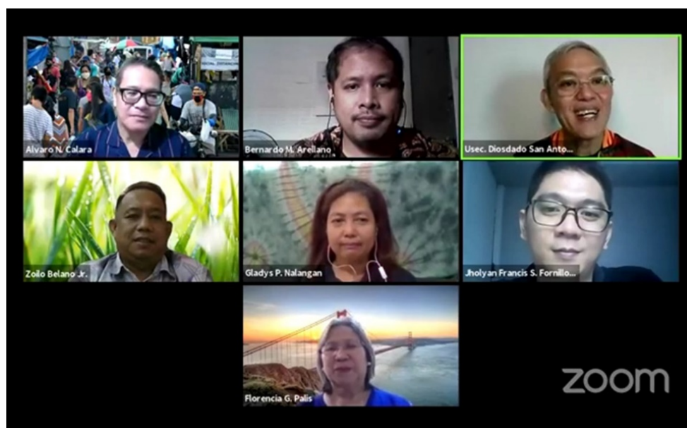
(UPLB Department of Social Sciences faculty members at the inaugural edition of USAP PH webinar series on Aug 20. )

Social scientists from UPLB and UPM highlighted the fact that COVID-19 transcends the health discipline. Through webinars and media interviews, they shared that the perspective of social sciences can be used in understanding the continuous increase of COVID-19 cases especially among individuals aged 20-40 years old. UPLB social scientists emphasized the importance of Filipino culture and adaptation during a pandemic, the role of LGUs in COVID-19 recovery, the importance of recording the pandemic as part of history, the psychological crisis that the public is facing, and the need to see the larger social issues.