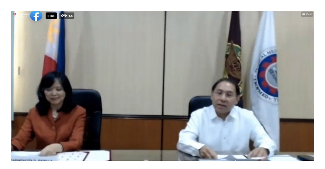
Signing Ceremony of the Memorandum of Agreement between UP Manila and the British Embassy Manila and launching of "Public Health in Time of COVID-19 and the New Normal: A UK BHP/UP CPH Webinar Series for Public Health Workers"

Now on its twentieth and twenty-first installment, STOP COVID DEATHS: VIRTUAL GRAND ROUNDS had been at the forefront of examining unique cases and experiences of healthcare workers during the pandemic. The most recent installments featured the effect of convalescent plasma therapy to a three-year old child with acute lymphocytic leukemia who became COVID-positive, and the potential complications of COVID-19 in the case of a patient with a history of Crohn's disease and showed symptoms of gastric distress and partial gut obstruction. Another webinar, entitled Epilepsy Lay Forum, focused on the management of patients with epilepsy in the time of pandemic.