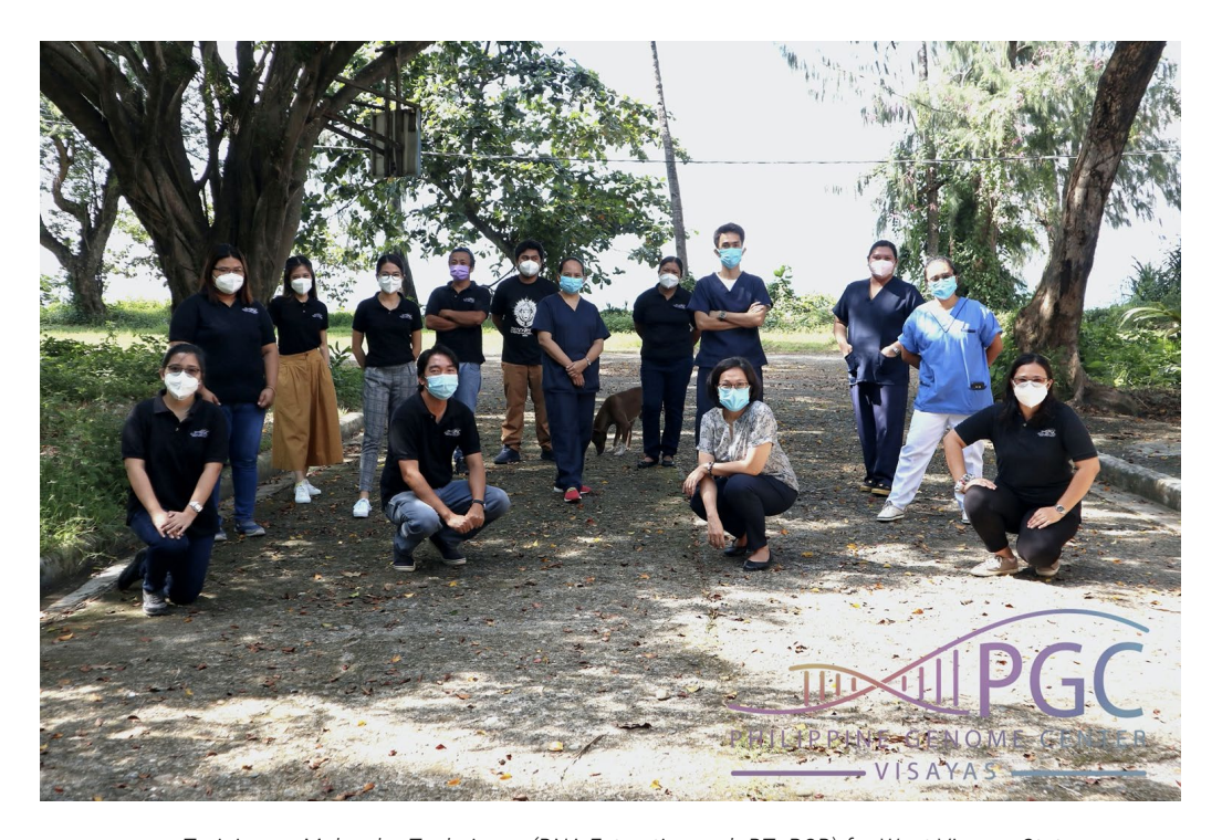
Training on Molecular Techniques (RNA Extraction and rRT- PCR) for West Visayas State University Medical Center COVID-19 Testing Laboratory Team.

Whole New World: Reigniting the Stalled Global Economy. The WebCon jumpstarted critical conversation and ignited ideas on how businesses could transform in response to the changes in the business landscape.