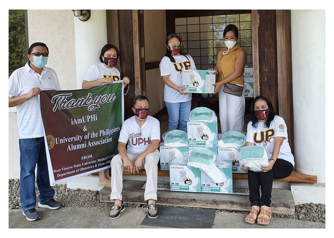
Donation of 10 complete sets of PAPR and 11 hoods to West Visayas State University.

Following the launch of the Kaagapay sa Pag-aaral ng Iskolar ng Bayan, a program that aims to raise funds to provide financially challenged students with equipment and Internet connectivity for their remote learning, CUs have also launched their own local campaigns. UP Cebu pitched Abag sa Pagtungha , as UP Baguio started its Kaagapay UP Baguio . Both programs aim to tap support for the remote learning needs of their financially challenged students. UP Open University's UPOU-Kaagapay+ also kicked off to address the unique needs of the UPOU students for remote learning.