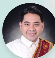
Outstanding Research, Extension, and Professional Staff

the conduct of programs and activities that strengthen competencies among nursing practitioners and professionals across the country. His most notable extension works were his involvement in crafting the monograph "Embedding and Spreading of the 2012 National Nursing Core Competency Standards," providing technical support to key nursing educational institutions for the CHED's project on the National Nursing Core Competency Standards, helping design and implement a new disaster training program for the Philippine Red Cross, and participating in the Cambodia Bridging Program of the College of Nursing.