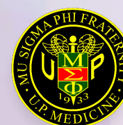
Outstanding Student Organization MU SIGMA PHI FRATERNITY, College of Medicine