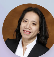
Outstanding Administrative Employee (Level 2)

actively championing the role of the Research, Extension and Professional Staff Association in UP Manila, being its current president. He is active in espousing the rights and privileges of UPM faculty and REPS as the current representative of the Central Administration to the All UP Academic Employees UP Manila Chapter and as secretary of the Research Personnel Fellowship Council and Research Welfare Council. He was a training course assistant in several CPH training programs commissioned by the Department of Health. He co-authored three published articles and contributed to several manuscripts and technical reports.