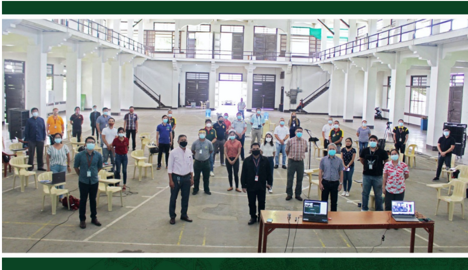
(UPLB training-workshop on disaster resilience last Dec. 1, 2020 at Baker Hall led by UPLB Office of the Vice Chancellor for Community Affairs in partnership with UP Resilience Institute.)

agroforestry, and global environmental community. UPLB also released IEC materials about flowers, fruits, and vegetables. Regarding technology, UPLB held a webinar on technology transfer while UPS conducted an open forum about procurement concerns. UPOU conducted an online exhibit featuring a collection of technologies, programs, projects, and services offered by the 23 Los Banos Science Community Foundation, Inc (LBSCFI) member agencies. Lastly, UPMIn conducted a webinar on AI-robotics and its impact on people's lives.