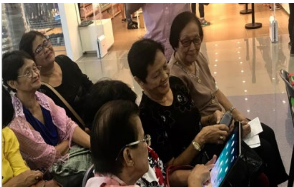
Photo 3: Senior citizens best candidates for COVID-19 Vaccination: expert

Following the University's attempt at adjusting to the new normal and its continuous endeavor of addressing the needs of both faculty and students, CUs have undertaken various public service initiatives that aimed to guide this sector. With a focus on the mental health and well-being of faculty in the middle of the pandemic, UP Manila held a webinar that gave an opportunity for the UPCM Faculty Association to present the pressing issues faced by faculty members. UP Diliman's Office of Field Activities, on the other hand, released a video series called OFA and AFAs: What You Need to Know, which aimed to guide the faculty, staff, and students in preparing documents that would ensure the safe and relevant implementation of academic field activities (AFAs) throughout the academic year. On a similar note, the University Library Diliman held a webinar series that presented the different resources accessible to the entire UP System. In an attempt to address student concerns and raise awareness regarding the different available support services for students, the UP Diliman Office of the Vice Chancellor for Student Affairs (OVCSA) organized a series of student dialogues while UP Los Baños Learning Resource Center conducted a webinar series on how to take online learning to the next level. A webinar series on research methods was also undertaken by the said CU which focused on conducting social