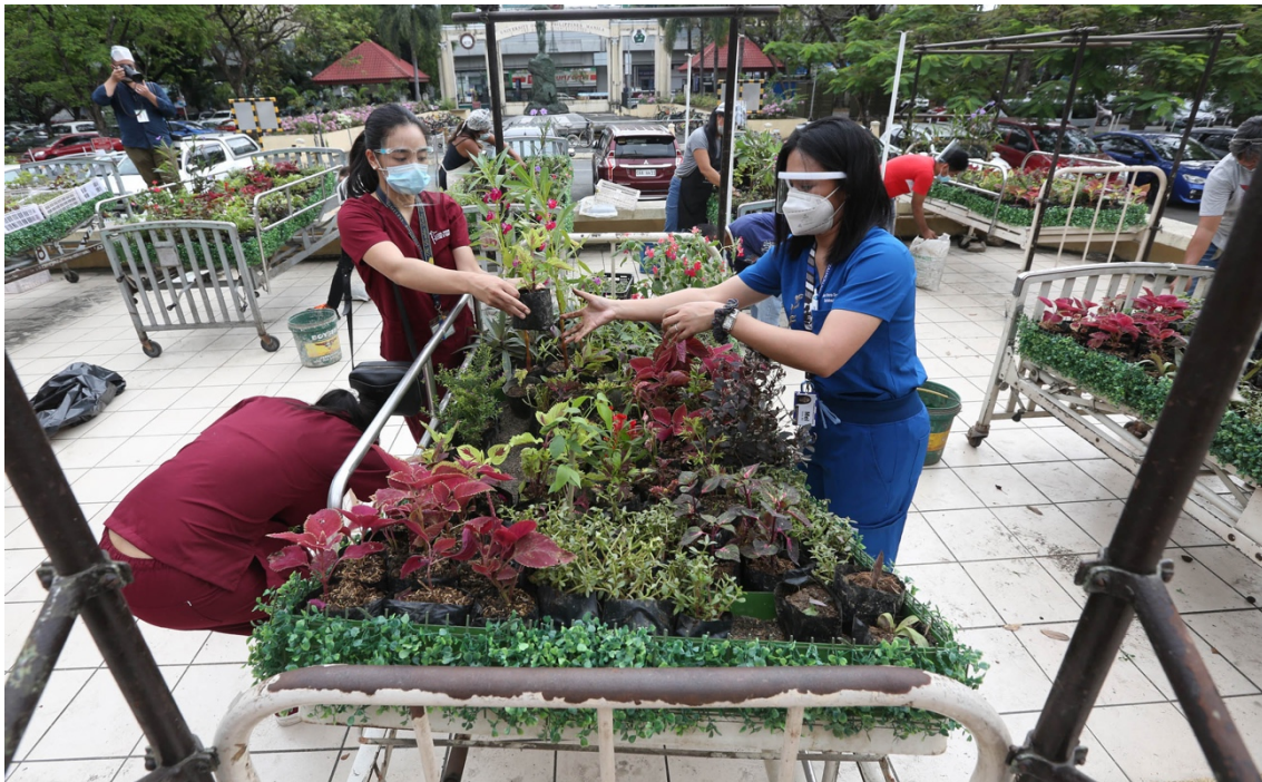
Photo 2: Whispering Flowerbeds installed at PGH to honor fallen frontliners

its Ugnayan ng Pahinungod also provided a short course on basic mental health and psychosocial support for its volunteers. UP Manila and Visayas, through webinars, highlighted the importance of coping with the pandemic and how people may ensure their wellbeing in the midst of a pandemic. Lastly, an art installation entitled, Whispering Flowerbeds was created by renowned sculptor and painter Toym Imao aimed to set as a reminder of the sacrifices of health workers and the many lives lost because of the government's poor handling of the pandemic.