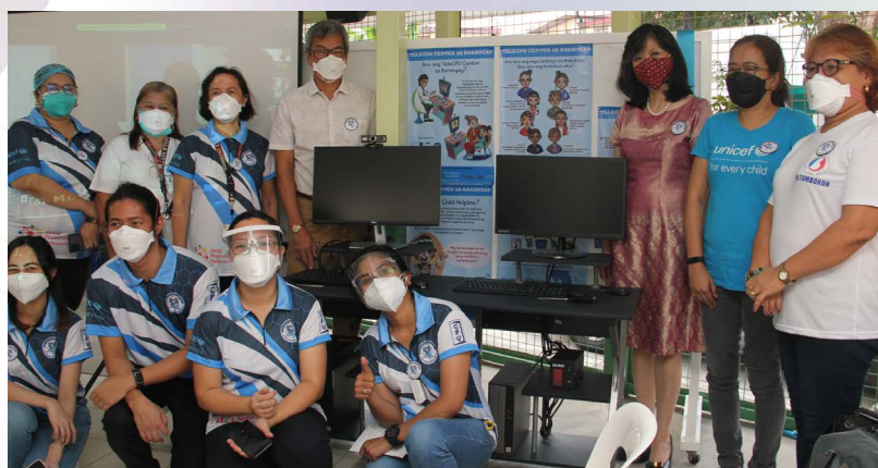
The inauguration of the TeleCPUs in the Barangay held at the PGH-CPU patient service area.

We do not know when this pandemic will end, but let us approach the future with hope and fortitude. Our community has withstood the onslaught of coronavirus; and with God's grace, we have been strengthened to face whatever challenges there are tomorrow!