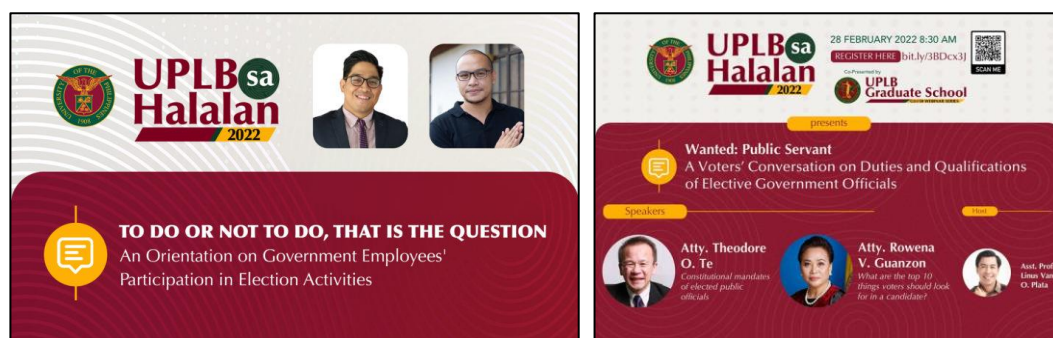
Webinars on voters' education as part of the UPLB sa Halalan 2022

In anticipating the 2022 National and Local Elections, CUs have conducted various voters' education webinar series, such as UP Los Baños' webinar To Do or Not to Do? That is the Question: An Orientation on Government Employees and Wanted: Public Servant - A Voter's Conversation on Duties and Qualification of Elected Government Officials as part of UPLB sa Halalan 2022. The UP Diliman Office of the Vice Chancellor for Student Affairs (OVCSA) launched Halalan , a weekly information dissemination program and centralized resource on pertinent UP-initiated and independent programs. In addition, UP Diliman organized the webinar Mambabatas: Ano Ba Talaga Trabaho Mo? which tackled the duties and responsibilities of aspiring legislators.