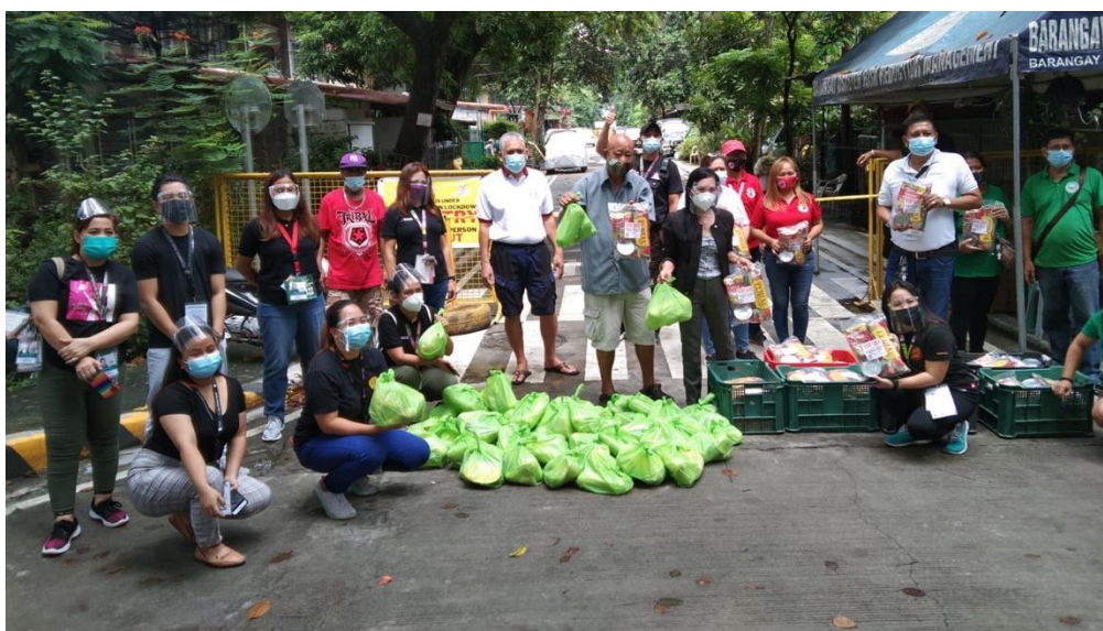
Relief goods handed out by DAMAYAN volunteers to pandemic-stricken UPD personnel.

Organizations such as the All UP Workers Union Diliman Chapter (AUPWU-Diliman) continue to lend a helping hand to the underprivileged, hence, Damayan sa Diliman initiative that aimed to provide relief assistance to impoverished communities in and near Diliman. The Ugnayan ng Pahinungód Baguio of the University of the Philippines manifested its mandate of serving the public as it celebrated its 28 th anniversary by donating over 300 children's books to the municipality of San Gabriel, La Union, on top of conducting storytelling training for children ( Ugnayan ng Pahinungód Baguio Book Drive and Storytelling Training ). In addition, the Ugnayan ng Pahinungód Baguio handed out boxes of relief donations to Tapsan Elementary School.