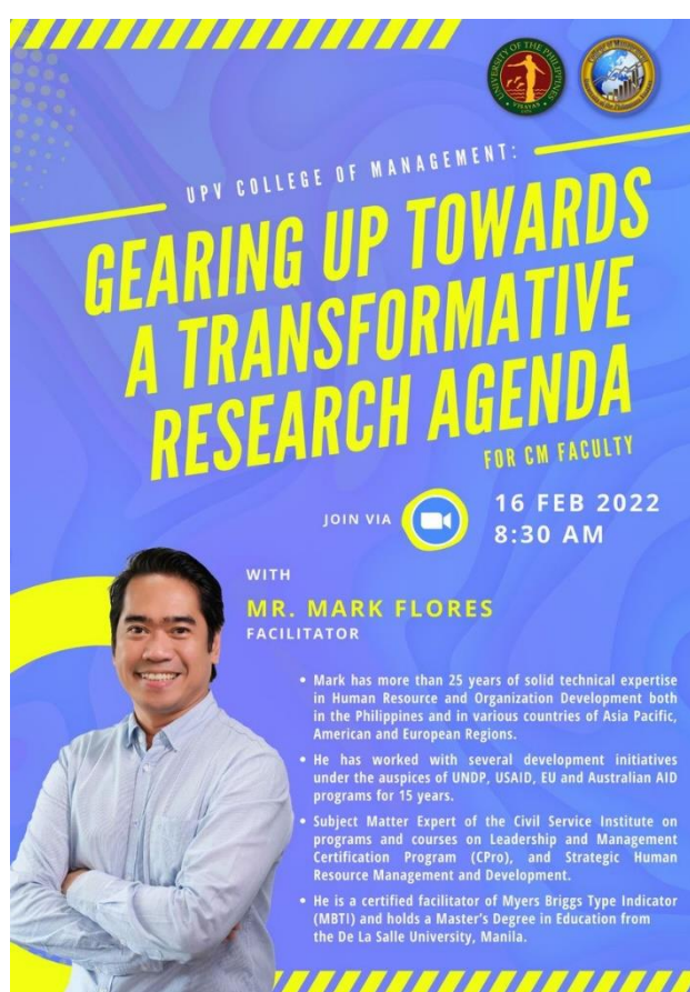
UP Visayas' webinar on developing research knowledge and expanding practice.

CUs also emphasized the importance of research publication, especially in the time of a pandemic, via organizing webinars such as UP Visayas' Gearing UP Towards a Transformative Research Agenda which focused on developing research knowledge and expanding practice, UP Baguio's Translating the Textual: Virtual Literary Programs and Publications in a Pandemic , the University of the Philippines Open University's (UPOU) Tips in Writing the Research Paper , and UPOU's Ethics Review, Principles, Policies, and Procedures .