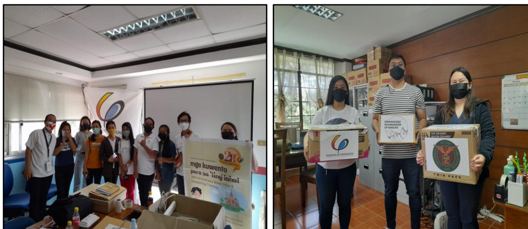
Ugnayan ng Pahinungód Baguio Storytelling Training (left) and turnover of donations to Tapsan Elementary School (right).

Vaccination and booster shots rollout continued in several CUs this month, with UPB administering immunization shots to its employees and their dependents. UP Diliman also continued to administer the second vaccine shots for the residents of adjacent communities, while UP Manila's College of Dentistry Vaccine Drive 2022 managed to inoculate 273 individuals with first doses and booster shots.