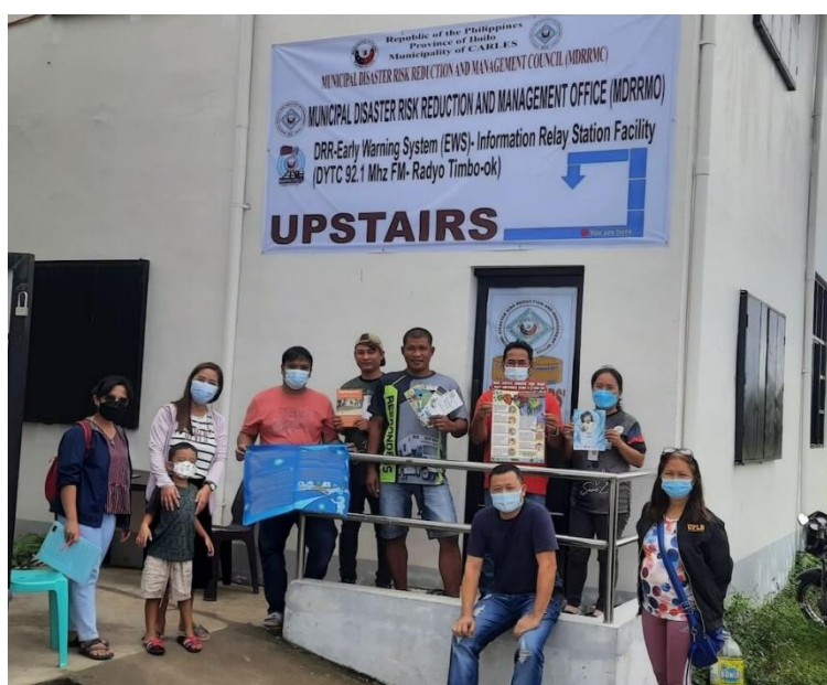
UPV COP-BIDANI and CWVS turn over COVID-19 IEC materials in Carles.

In the University of the Philippines Visayas' (UPV) efforts to combat COVID-19 misinformation, the UPV Community Outreach Program (COP) - BIDANI and the Center for West Visayan Studies turned over COVID-19 IEC materials in Carles as part of the TEACH DRR Project of UP Visayas Foundation, Inc. (UPVFI).