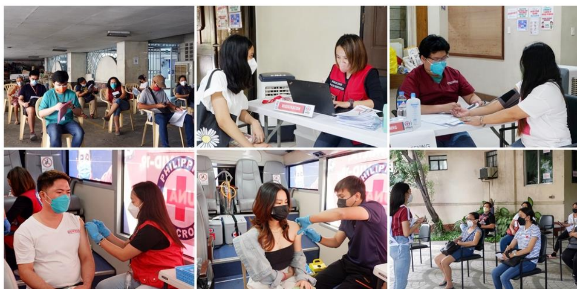
UP College of Dentistry Vaccine Drive 2022

Vaccination and booster shots rollout continued in several CUs this month, with UPB administering immunization shots to its employees and their dependents. UP Diliman also continued to administer the second vaccine shots for the residents of adjacent communities, while UP Manila's College of Dentistry Vaccine Drive 2022 managed to inoculate 273 individuals with first doses and booster shots.