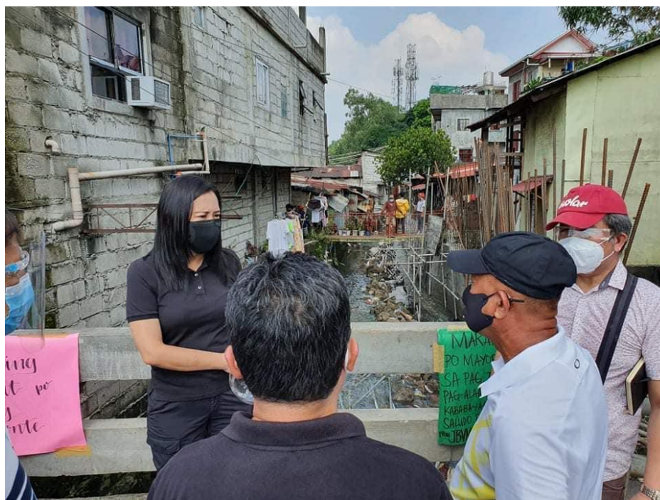
Members of the UP Resilience Institute conducted field visits in preparation for the implementation of the QC Drainage Master Planning.

flooding, as part of UP's collaboration with the Quezon City Government to implement the city's Drainage Master Planning . Finally, UP Los Baños launched the first Virtual Halal S&T Knowledge Center , a web-based and open-access knowledge hub related to the global halal market.