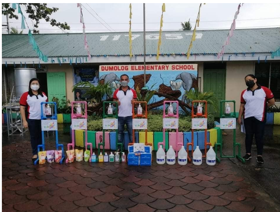
The UP Fisheries Guild donated alcohol, hand wash, face masks and infrared thermometer to Dumolog Elementary School.

Public service programs initiated by UP units and students also endeavored to provide other means of support for marginalized sectors. The second Career Convention of UP Los Baños strove to help students and non-students navigate the “new normal” of working and career pivoting. The Office of Scholarship and Grants also utilized the Aid and Scholarship Services Informational Support to Students (ASSIST) platform to inform UPLB students about available grants-in-aid, student loans and claims, scholarships, and the University’s student assistantship program. Kuwentuhan Tungkol sa Pagtulong sa Mga Batang nasa Laylayan , a webinar organized by the UP College of Education, explored the innovative ways of addressing the immediate and longterm needs of less-privileged children. Finally, the UP Fisheries Guild of UP Visayas organized a fundraising campaign that had helped in its purchase of alcohol dispensers that it donated to the Dumolog Elementary School.