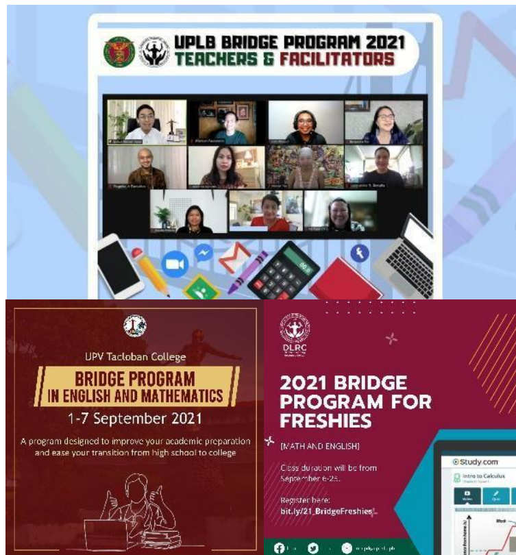
Bridge programs prepared incoming UP students for subjects they will take in college.