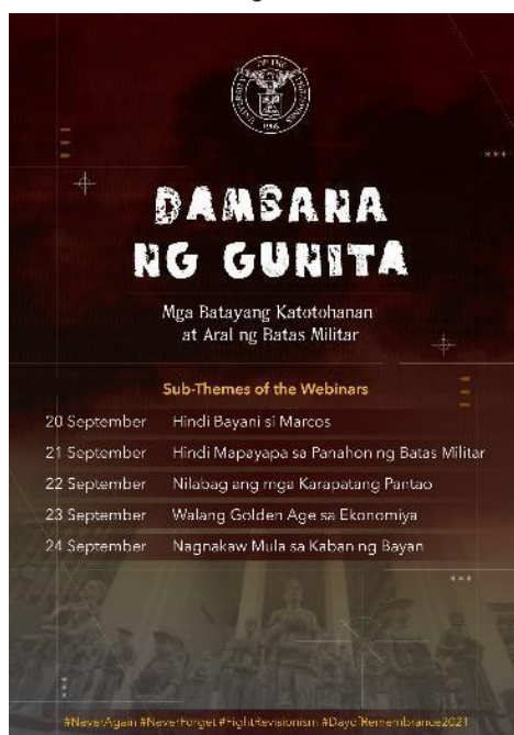
The Dambana ng Gunita is a series of webinars that shared realities and lessons about the Marcos dictatorship.

September marks the UP Day of Remembrance, an annual commemoration of the University's resistance to the dictatorship. This year, the week-long Dambana ng Gunita featured realities of and lessons from the Marcos Regime, with particular focus on Martial Law, and refuted false claims about this dark part of our history. UP Diliman followed this with Kwentong Mulat: The Diliman Commune Virtual Pasyal which was organized by the Asian Institute of Tourism to transport viewers back to the days of the Diliman Commune when the UP community, particularly the students and the administration, took a stand against the Marcos dictatorship.