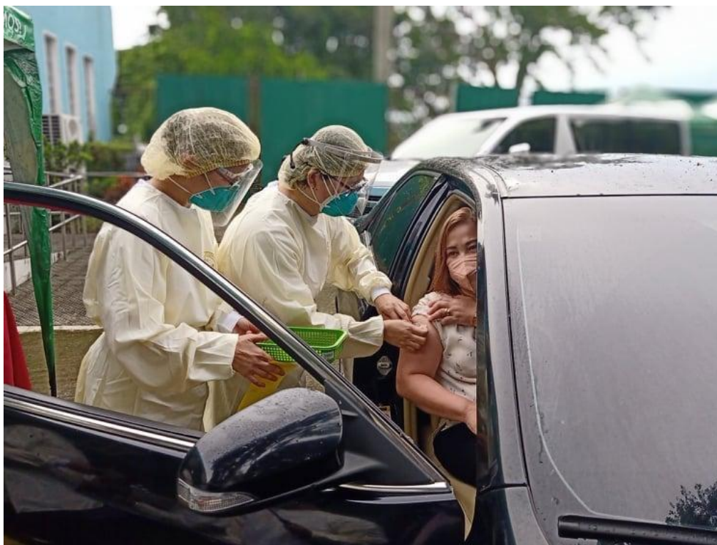
The UPLB University Health Service opens the drive-thru option for vaccinees.

The Bakunahan sa Diliman program of UP Diliman opened vaccination slots for students this month, a step made in preparation for the implementation of face-to-face classes. In UP Los Baños, the vaccination program was expanded to accommodate vaccinees who preferred the drive-thru mechanism.