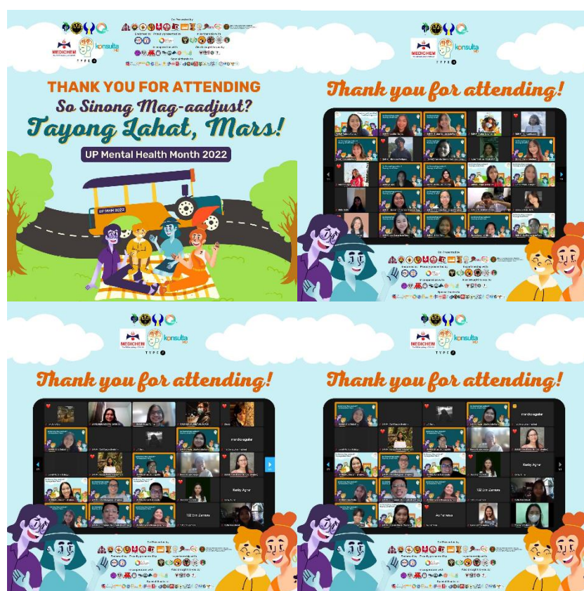
Participants from So sinong mag-aadjust? Tayong Lahat, Mars! webinar by UP MHM