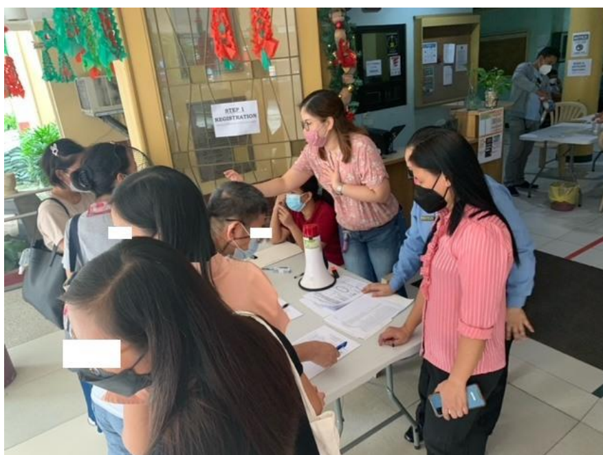
People registering for the UPCM Breast, Cervix, and Prostate Cancer Screening Program

The University Health Service (UHS) across each CU adheres to its function as a model health facility that provides only the best primary care services for its constituents. The UP Diliman Health Service offered another RT-PCR swab testing for its residents and started the booster vaccination rollout to immunize the members of the UP Diliman community. Along the same vein, the UP Los Baños Health Service distributed pneumonia and flu vaccinations as part of the Kalusugan Festival in celebration of the 25th anniversary of the Office of the Vice-Chancellor for Community Affairs. The festival conducted a variety of free health services such as diagnostic screenings, provision of pharma and nutraceuticals, and distribution of free medical supplies. The UP Manila College of Pharmacy Gender Committee, in collaboration with the Philippine Cancer Society, held the Breast, Cervix, and Prostate Cancer Screening Program which examined 61 and 14 patients for breast/cervical and prostate cancer, respectively.