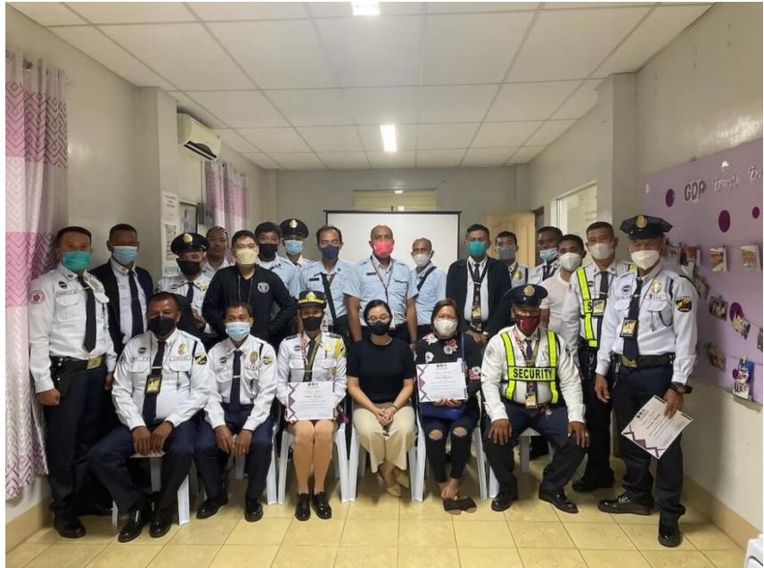
UPV guards as participants of the Gender Awareness and Sensitivity Orientation and the Anti-Sexual Harassment (ASH) Orientation

Orientation required for the recognition of student organizations. Furthermore, the UP Baguio Office of Anti-Sexual Harassment held consultations regarding the revised draft of the Anti-Sexual Harassment Code . In celebration of UP Pride 2022, discussions centered on gender equality in the local and national contexts were held in UP Diliman's three-episode Equality Talks . As for UP Visayas' contribution to the cause, the UPV Gender and Development Program, together with the Ugsad Regional Gender Resource Network, organized the webinar Pride Representation: Discussing Gender and SOGIESC in Today's Landscape which shed light on the topic of gender representation in media and status of SOGIESC in the country. The UP Diliman Gender Office hoisted the colors of the LGBTQIA+ community in the Raise Your Flags! Common LGBTQ Flags and Identities infographics uploaded on social media.