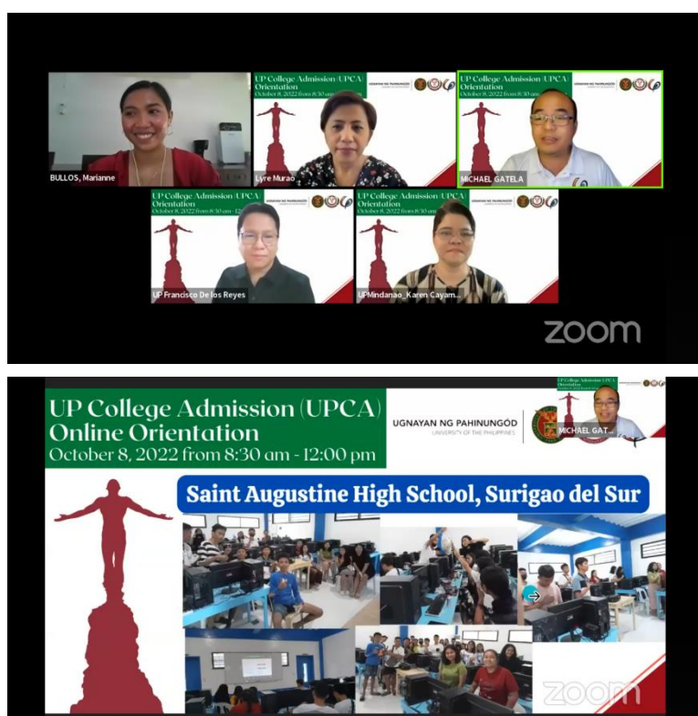
UP Mindanao College Admission 2023 Orientation webinar

As higher education institutions ease into the new normal after two years of remotely holding classes, the University has updated both its administrative and academic processes following the issuance of Memorandum 2022-123 otherwise known as Guidelines for Campus-based Activities under Different Alert Levels and the PGH-HICU Guide . The UP Diliman Cash Office has included a contactless method in transactions where payments can be completed through GCash. The UP Mindanao Ugnayan ng Pahinungod, together with the UP Office of Admissions and UP Mindanao Registrar Office, conducted its UP College Admission 2023 Orientation via webinar. School principals, senior high school coordinators, and senior high school graduates and students can review the orientation by visiting the Facebook page of UP Mindanao. The UP Diliman College of Science held a hyflex (online and onsite) public seminar titled Pagbabalik sa Unibersidad: Mga Aral Batay sa Paghahanda at Karanasan which provided a platform for health experts to discuss the best practices for conducting safe face-to-face interactions. On the other hand, UP Los Baños held an orientation on COVID-19 campus prevention and mitigation protocols and the use of the Online Health Monitoring System (OHMS) for its student.