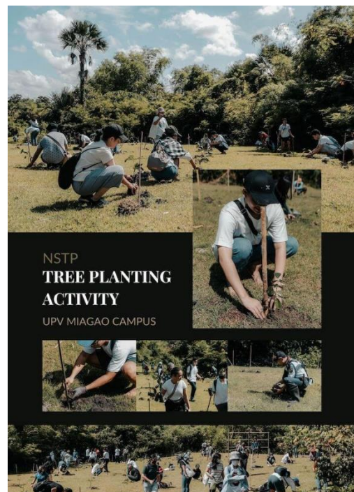
NSTP tree planting activity at the UPV Miagao campus

In an effort to support environmentalism, a number of “greening” initiatives were organized by CUs. The UP Diliman Environmental Management Office (DEMO), together with the Quezon City Environment Multi-Purpose Cooperative, Inc. (QCEMPCI/Linis-Ganda), conducted a drop-off and collection program for recyclable materials and single-use plastics in the UP Diliman campus. In a much greener perspective, the UP Visayas Miagao campus organized an NSTP Tree Planting Activity and planted a variety of trees close to identified camping ground in the campus. In the same vein, UP Visayas and the UP Validus Amicitia Brotherhood inked a Memorandum of Agreement for the Establishment of an Eco-Trail Project in the UP Visayas Miagao campus.