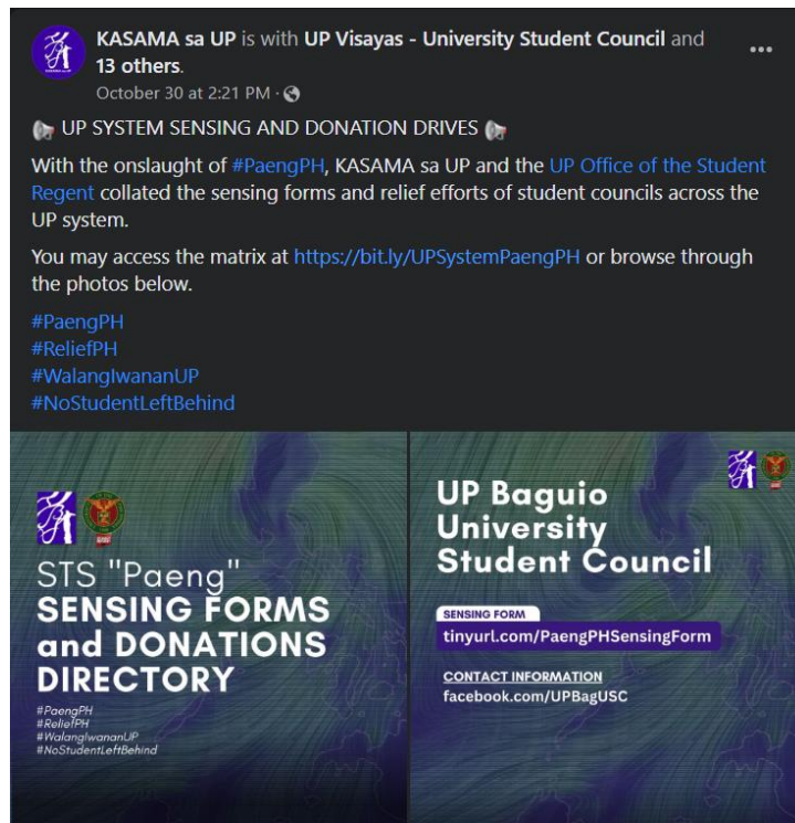
Social media post of the UP System Sensing and Donations Forms for the victims of Typhoon Paeng

In an effort to support environmentalism, a number of “greening” initiatives were organized by CUs. The UP Diliman Environmental Management Office (DEMO), together with the Quezon City Environment Multi-Purpose Cooperative, Inc. (QCEMPCI/Linis-Ganda), conducted a drop-off and collection program for recyclable materials and single-use plastics in the UP Diliman campus. In a much greener perspective, the UP Visayas Miagao campus organized an NSTP Tree Planting Activity and planted a variety of trees close to identified camping ground in the campus. In the same vein, UP Visayas and the UP Validus Amicitia Brotherhood inked a Memorandum of Agreement for the Establishment of an Eco-Trail Project in the UP Visayas Miagao campus.