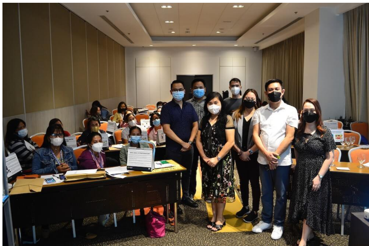
UPV, WHO, and DOH in the Training of Trainers on NCD flipchart rollout

Health Workers (BHWs) in Visayas, faculty members from UP Visayas comprised the Training of Trainers team as part of the Health Hearts Program. The team aimed to train the BHWs in the use of the noncommunicable disease (NCDs) flipchart, produced by the Department of Health and World Health Organization, which contains information on NCDs such as hypertension, diabetes, cancer, and certain types of pulmonary diseases. The UP Los Baños Institute of Biological Sciences, on the other hand, conducted a Hands-on Demo Training Workshop on the Use of ELISA in partnership with Noveaulab.