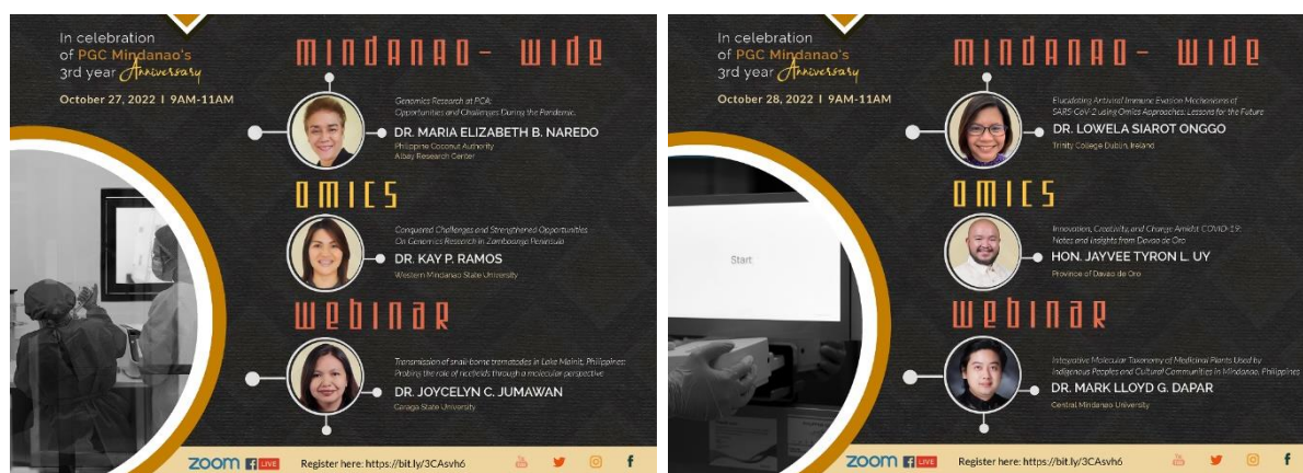
The Mindanao-Wide Omics Webinar, in celebration of PGC Mindanao's 3rd year anniversary

The University Health Service (UHS) across each CU adheres to its function as a model health facility that provides only the best primary care services for its constituents. The UP Diliman Health Service offered another RT-PCR swab testing for its residents and started the booster vaccination rollout to immunize the members of the UP Diliman community. Along the same vein, the UP Los Baños Health Service distributed pneumonia and flu vaccinations as part of the Kalusugan Festival in celebration of the 25th anniversary of the Office of the Vice-Chancellor for Community Affairs. The festival conducted a variety of free health services such as diagnostic screenings, provision of pharma and nutraceuticals, and distribution of free medical supplies. The UP Manila College of Pharmacy Gender Committee, in collaboration with the Philippine Cancer Society, held the Breast, Cervix, and Prostate Cancer Screening Program which examined 61 and 14 patients for breast/cervical and prostate cancer, respectively.