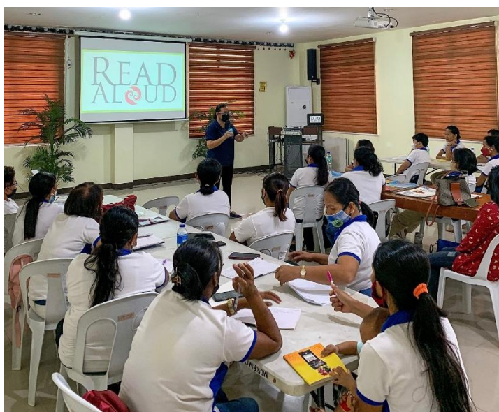
Daycare teachers attend UPV's READ UP: A language and literacy training

The University remains unhindered in maintaining its lead in setting academic standards in spite of the pandemic. Each CU strives to provide avenues for knowledge-sharing in various fields, as well as opportunities for training and developing both academic and non-academic skills through public webinars, online conferences, and hyflex workshops. One such example is READ UP: A language and literacy training organized by the UP Visayas Language Program. The two-day workshop made use of read-aloud strategies to improve daycare teachers' aptitude for creativity, pedagogical approach, and language skills. The University also develops innovative methods for learning especially in Higher Education Institutions (HEIs), such as UP Open University's Open Talk episode dubbed "Developing Immersive Learning Programs for Higher Education: AR, VR, and Beyond" which explored the possibilities of using augmented reality (AR) and virtual reality (VR) as a platform for higher learning. Likewise, UP Los Baños' Graduate School held the UPLB Graduate Education Summit with the theme "SHAKERS: Shaping Knowledge Ecosystems for a Reimagined Society".