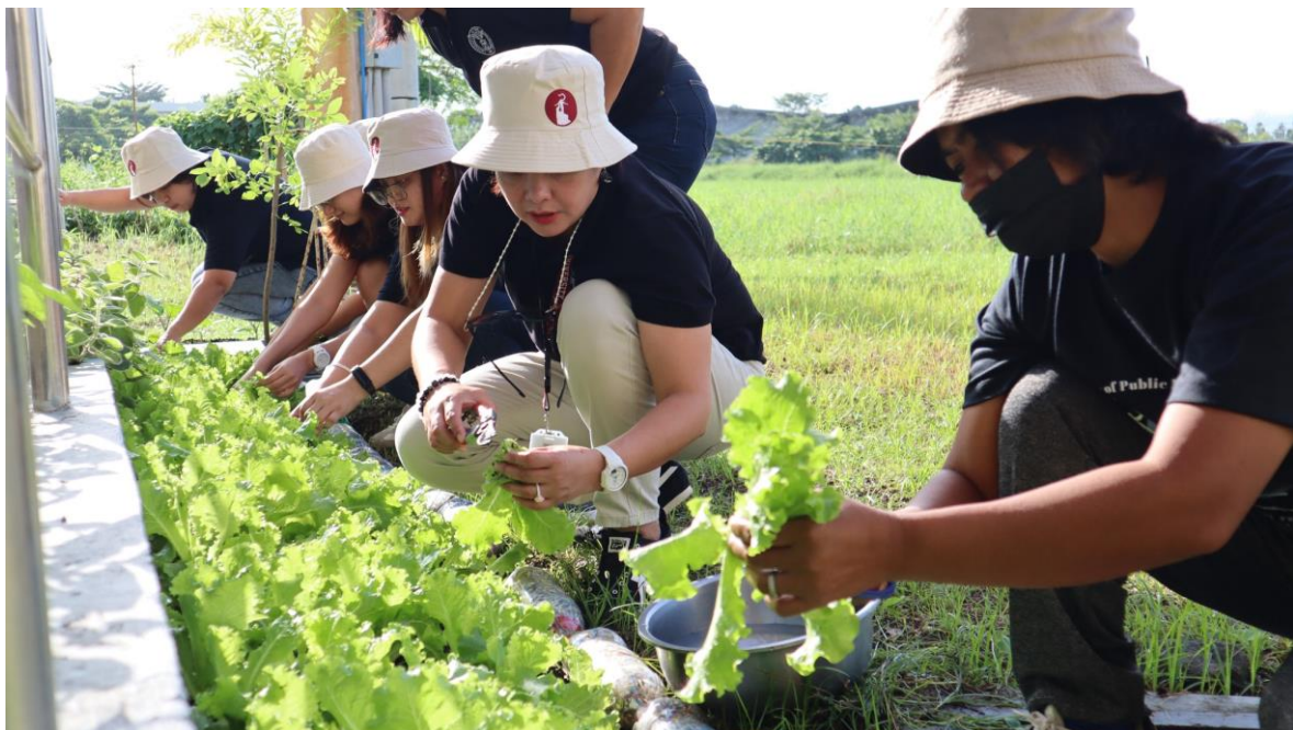
[UP Open University] Edible Garden Project at the Teaching and Learning Hub

The holiday season has become an opportune time for CUs to show compassion. The UP Mindanao community, in celebration of Kasadya 2022, organized the Paghinatagay—a gift-giving event for the benefit of the families and communities from the UP Mindanao Land Reserve-Laak Area. The UPV Employees Cooperative (UPVEC), in collaboration with UPV Ugnayan ng Pahinungod/Oblation Corps (UPV UP/OC), CFOS Public Service Program (CPSP), and other partner CFOS student organizations, organized the PaskOOPerasyon. The event was a Christmas gift-giving program that aimed to help the coastal families of Miagao, Iloilo that were affected by Severe Tropical Storm Paeng last October. This event provided an avenue for the UPV community to uplift their spirits through the sharing of meals, grocery packs, and games with prizes.