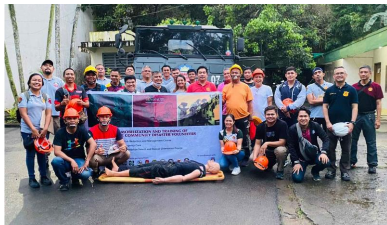
[UP Los Baños] Capacity-building program on Basic Disaster Risk Reduction Management

With its experts in Disaster Risk Reduction Management (DRRM), the University has been leading in its delivery of DRRM-related initiatives and interventions. The UPLB Community Affairs Security and Security and Safety Office conducted a seven-day capacity-building program on basic disaster risk reduction management for representatives of various offices in the university. Focusing on high-threat emergency care, mass casualty incident response, and earthquake and landslide search and rescue orientation, the program was set to organize a team of UPLB community disaster volunteers and capacitate them in the basics of disaster and emergency response. The participants included representatives from the University Health Service, University Housing Office, University Planning and Maintenance Office, Land Grant Management Office, Makiling Center for Mountain Ecosystems, and the Department of Military Science and Tactics. It also included participants from the two nearby barangays of Batong Malake and Tuntungin Putho.