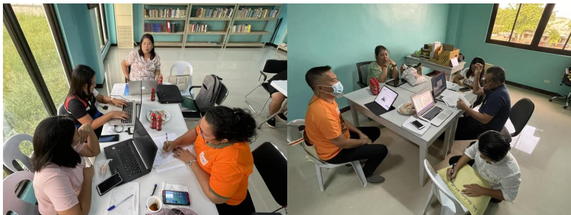
[UP Cebu] Teachers Professional Development on Research Proposal Writing

In line with the University's commitment to exhibiting honor and excellence by sharing its expertise, its CUs have spearheaded various training programs that address a variety of issues and concerns. The UP-Cebu Ugnayan ng Pahinungod organized a Teachers Professional Development on Research Proposal Writing activity that trained selected teachers from Cebu Technological University-Carmen.