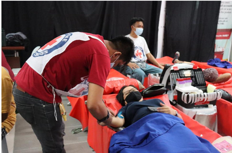
UPOU Blood Donation Drive

Forum tackling what the disease is, how to deal with its symptoms, if it's curable, and if vitamins can help with its management. The UPOU also held a blood donation drive on 4 April. It had 124 volunteers and garnered 79 total blood bags.