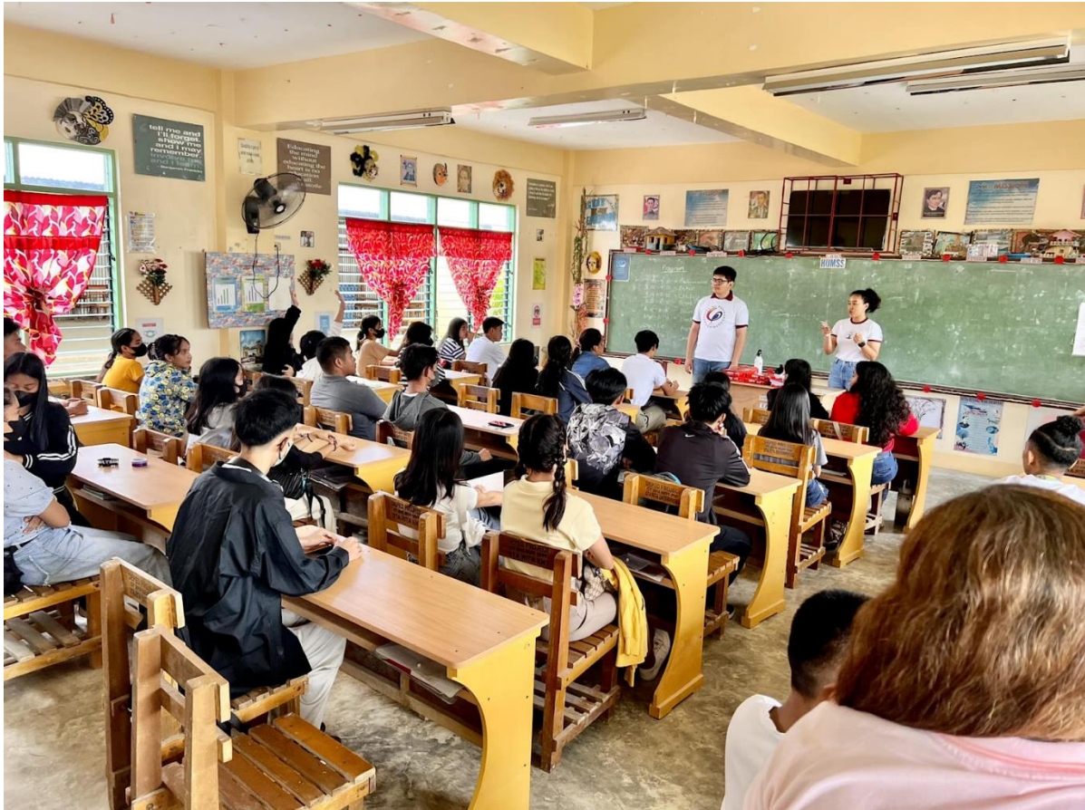
UP Tacloban Ugnayan ng Pahinungod Southern Leyte English tutorial session

In April, the UP Ugnayan ng Pahinungod conducted its Affirmative Action Program in different areas of the country. The program aims to enhance the knowledge and skills of Junior and Senior high school students through review and tutorials in preparation for college education. The UP Tacloban Ugnayan ng Pahinungod conducted an English tutorial session on 22 April for Grade 11 students from different public high schools in Eastern Samar. On 29 April, organizers held another English tutorial session for 107 Grade 11 students in Southern Leyte, and a Math tutorial session for 91 Grade 11 students in Eastern Samar. An orientation for the Affirmative Action Program was also held in Laguna for Grade 11 students and their guardians from different high schools in the area, which is planned to start on 6 May.