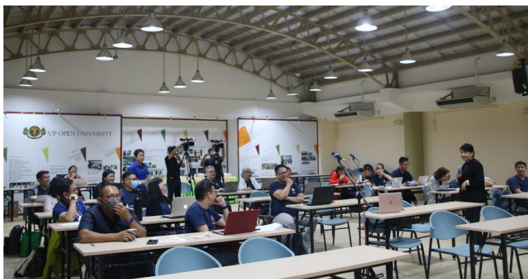
Day 2 of UPOU Open Distance eLearning Training

The Office of the Faculty Regent continued its initiative called UGNAYAN or Usapang Guro at Pamayanan , a series of faculty meetings with different CUs and UP campuses. The aim of the talks is to share initiatives and programs and know the status and issues of the faculty and employees with regard to University policies. The CUs included UP Manila, Visayas (Miag-ao and Iloilo Campuses), Baguio, and Cebu. In a similar vein, UP Economics Towards Consciousness held a multi-perspective talk on paychecks, prices, and productivity in the Philippines on 1 April. Speakers discussed the areas for reform in the labor market and the other important institutions in the Philippine economy.